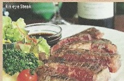
Rib eye Steak