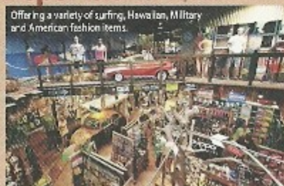
Offering a variety of surfing, Hawaiian, Military and American fashion items.