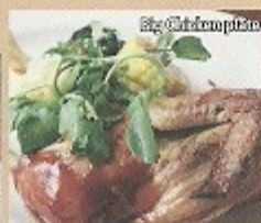
Big Christmas Dinner